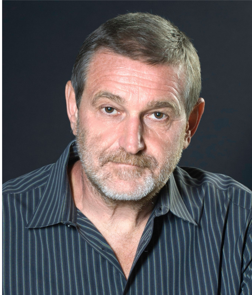
Fig 1. Pavel Pevzner.

https://doi.org/10.1371/journal.pcbi.1005561.g002