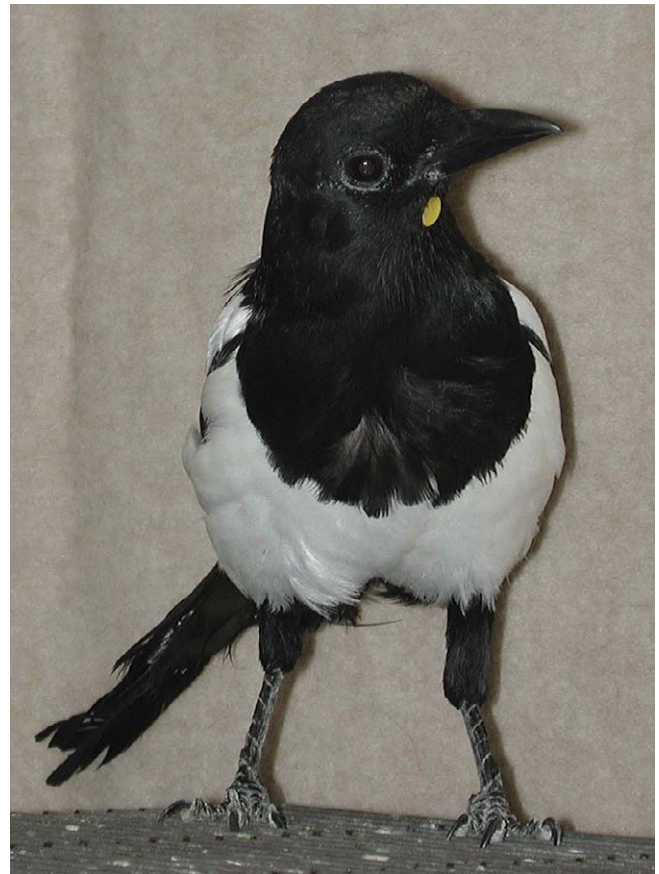
Figure 1. Magpie with Yellow Mark doi:10.1371/journal.pbio.0060202.g001

In baseline trials with a nonreflective plate, there was no remarkable behavior in front of the plate in any of the individuals. With a mirror, the behavior of the magpies clearly differed. Initial exploration of the mirror was characterized by approaches towards the mirror and looks behind the mirror. Also, social behavior occurred, such as aggressive displays towards the mirror and jumping towards the mirror as in a fight. In three individuals, Gerti, Goldie, and Schatzi, social behaviors were transient, i.e., they were