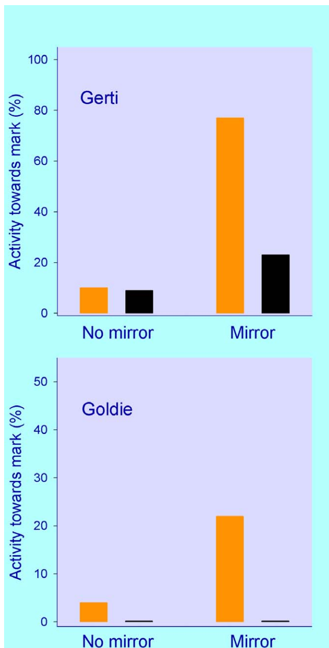
Figure 3. Proportion of Self-Directed Behavior towards the Mark Area Expressed as a Proportion of Overall Self-Directed Behavior in Subjects Gerti and Goldie

Orange bars refer to tests with a colored mark (yellow or red), black bars to tests with a black control mark (sham condition). In Gerti ( p < 0.005 , Fisher exact test), as well as in Goldie ( p < 0.05 , Fisher exact test), mark-directed behavior was significantly enhanced in the colored mark and mirror condition.