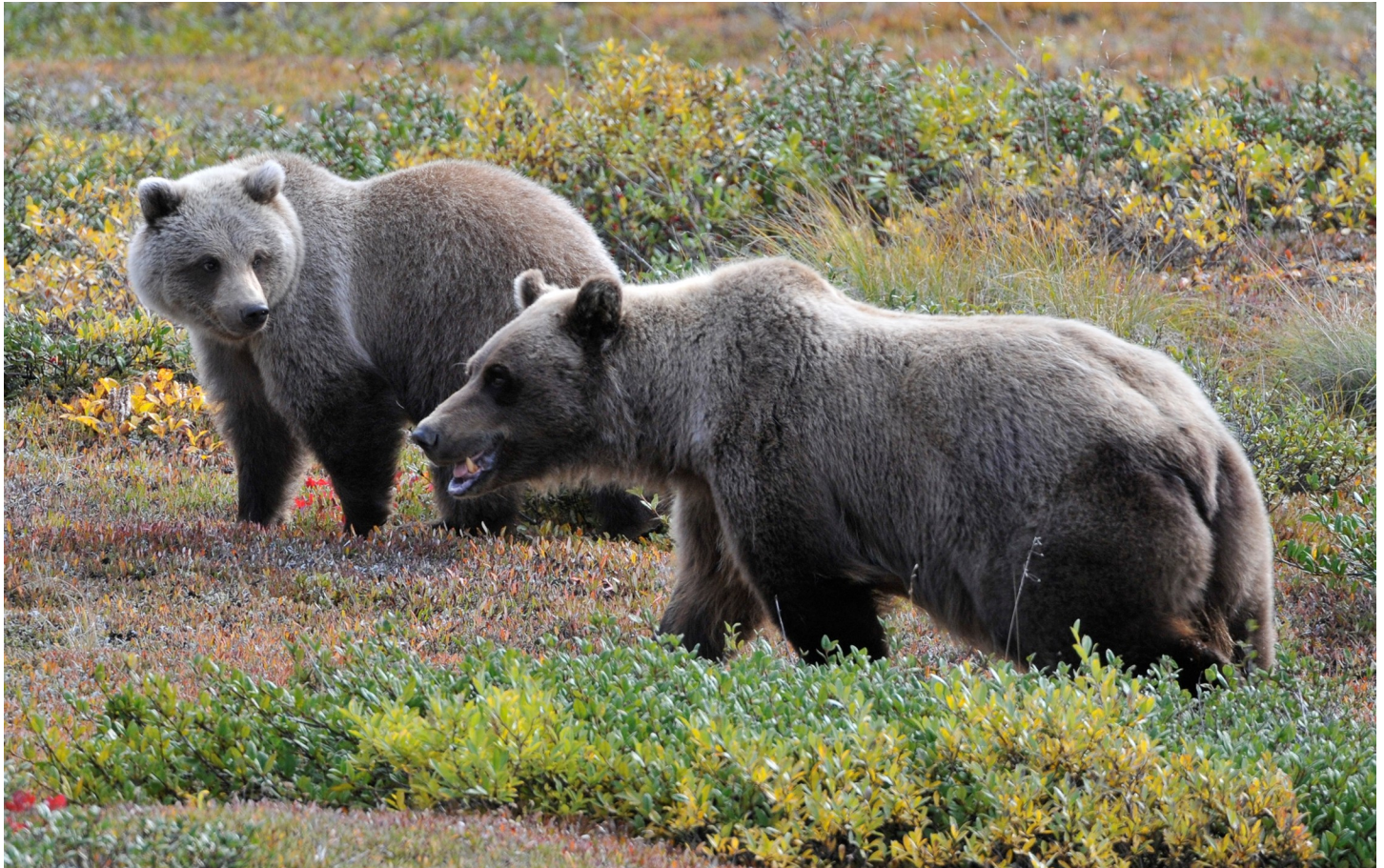
Fig 1. Alaskan brown bears in Denali National Park.

https://doi.org/10.1371/journal.pbio.3000090.g001