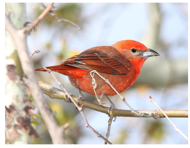
Fig 1. Hepatic tanager. https://doi.org/10.1371/journal.pbio.3000020.g001

In their PLOS Biology article, Jonathan Drury, Hélène Morlon, and colleagues study how competition between species within the tanager family, the largest family of songbirds, has shaped their trait evolution [1] (Fig 1). While the role of competition has been studied in the context of resource use for spatially constrained island-based species, such as Darwin's finches, here they study a large radiation across Central and South America and include social traits such as plumage signals and song. Using an impressive data set and a novel framework, they show that competition strongly impacted the diversification of resource-use traits like beak morphology but had a far weaker effect on social signaling traits like song tempo and frequency. They observed that these social signaling traits evolved more rapidly, which fits with previous theory that these traits evolve during the phase of speciation when the newly forming species is geographically isolated from other closely related species. When secondary contact