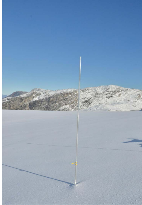
Fig 5. Example of an ablation stake installed at Qassinnguit Sermiat in Kobbefjord, SW Greenland, operated by Asiaq Greenland Survey within the interdisciplinary Greenland Ecosystems Monitoring (GEM) programme.

https://doi.org/10.1371/journal.pclm.0000596.g002