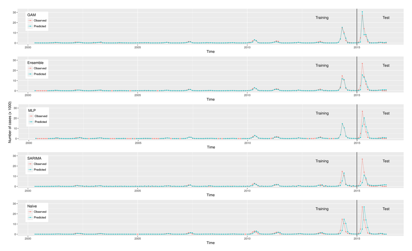
Fig 1. Observed and predicted number of dengue cases in training and test data from São Paulo, Brazil, 2000–2016. Predictions were made by models presented in Table 4.

https://doi.org/10.1371/journal.pone.0195065.g001