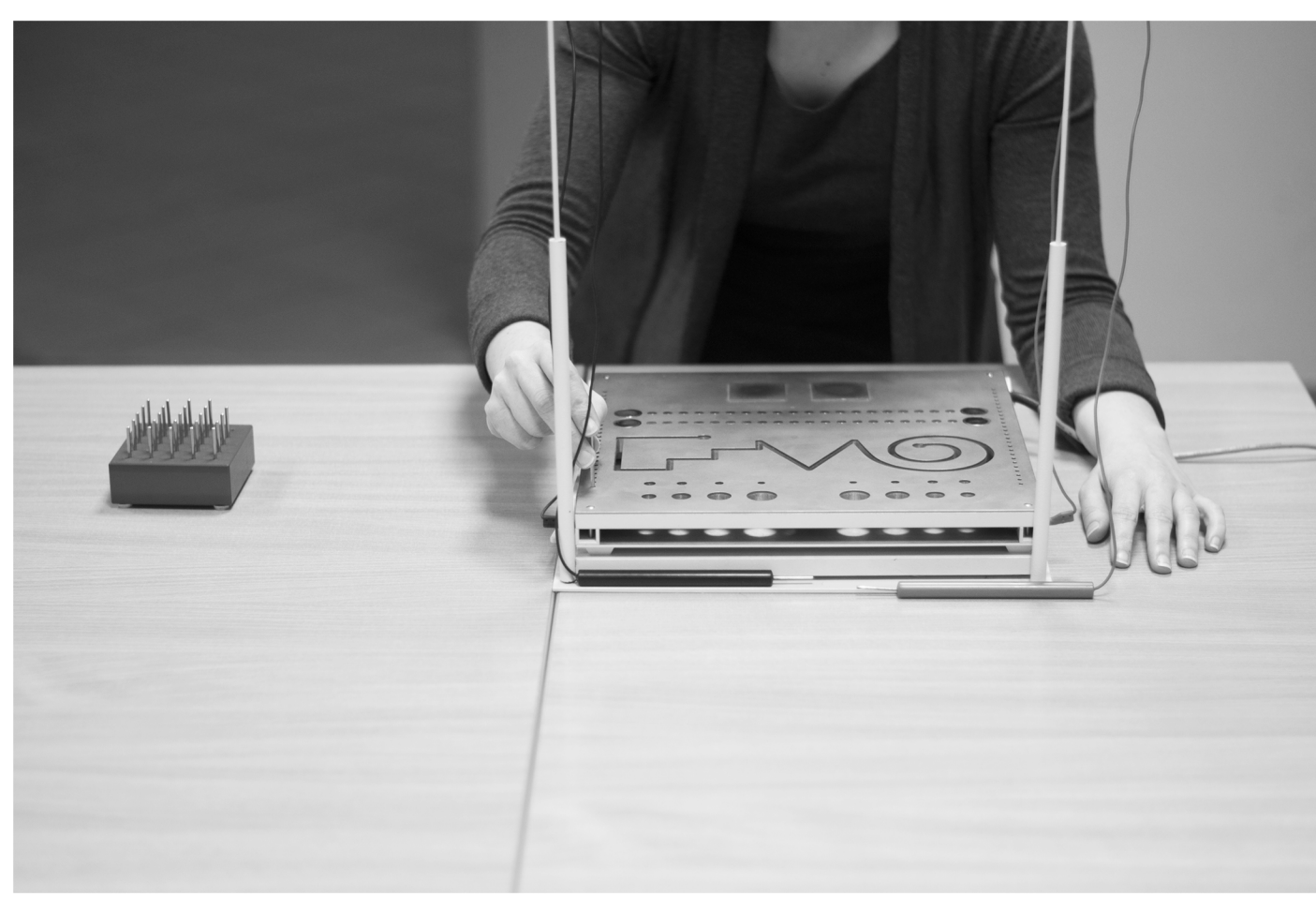
Fig 2. "Inserting Long Pins" task on the MLS test board.

https://doi.org/10.1371/journal.pone.0177845.g002