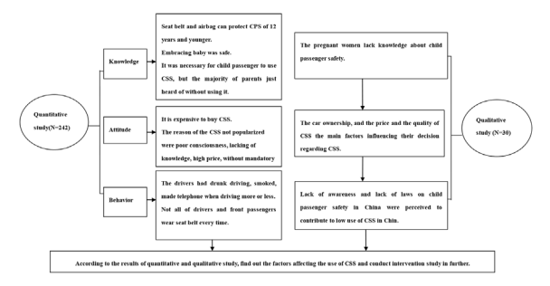
Fig 1. Chart of the Study Procedure.

Survey participants. Two hospitals in Shantou, a coastal city located in China, were randomly selected: (1) Shantou Women's and Children's Hospital, a general hospital equipped with 60 ward beds with about 300 infants delivered per month, and (2) Shantou University-the First Affiliated Hospital, a general hospital equipped with 50 ward beds with 250 infants delivered per month. Both were non-profit hospitals. Pregnant women from these two hospitals have similar demographic characteristics, such as language, income, educational background and occupation (P>0.05), and thus, they may share similar views on CSS use. A convenience sample of parents of newborns was recruited to complete a questionnaire in person in the maternity wards after delivery. The inclusion criteria were: (1) the parent of a newborn; (2) both the parent and the newborn were healthy without any adverse postpartum symptoms; and (3) agreed to participate through a signed consent document. Parents who did not speak mandarin or could not read or write were excluded. In the study, no one was excluded because they did not meet the criteria.