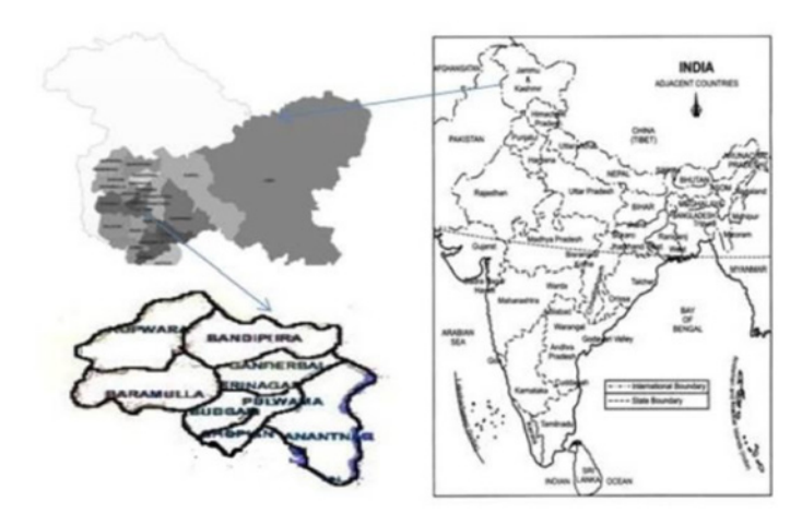
Fig 1. The geographic location of the surveyed population in Jammu and Kashmir, North India. Right: Map of India, Left up: Kashmir Valley within State of Jammu and Kashmir and Left down: Map of Kashmir Valley showing nine districts where study was conducted.