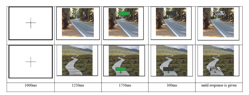
Fig 2. Temporal sequence of the presentations in the signal detection task in Experiment 1. In the first row, a weak signal is presented in a distal location. In the second row, a strong signal is displayed in a proximal location. In the third row, the presentation times for each picture are displayed.