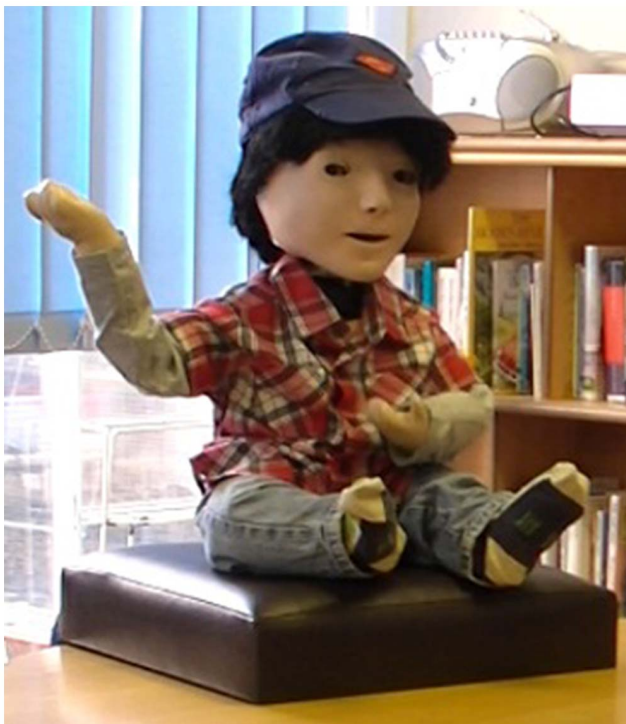
Figure 1. KASPAR robot. doi:10.1371/journal.pone.0059448.g001

The robot KASPAR (Figure 1) used in this study is a child-sized, humanoid robot with a minimally expressive face and arms that are capable of gesturing. This robot has been shown to be very effective when working alongside typically developing children [14,34] and children with autism [10,11,16,35]. Robins et al. explored how children adapt to interacting with a robot and will mirror a robot's temporal behaviour [15]. KASPAR has also been used to explore aspects of human-robot interaction relating to the