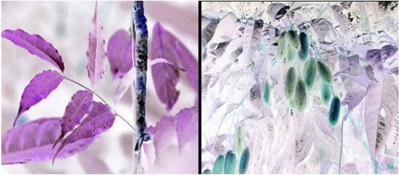
Figure 1. Photos of Fumbwa leaves (A) and Africanum pear Safou fruit (B). doi:10.1371/journal.pone.0049411.g001

separated the blood samples at LOMO Medical Laboratory within 45–60 min.