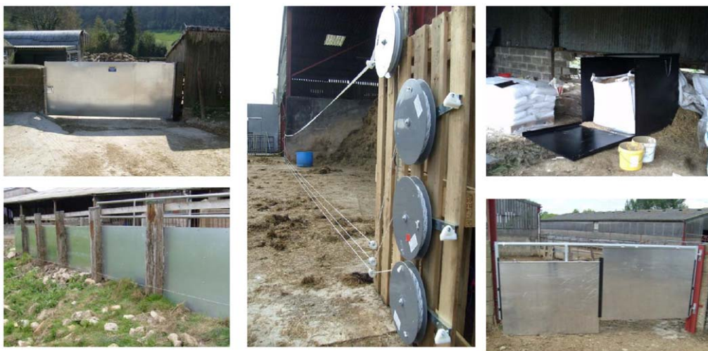
Figure 1. Examples of badger exclusion measures: solid aluminium sheeted gate (top left), aluminium sheeting installed on rail fence (bottom left), retractable electric fencing (middle), front and top opening aluminium feed bin (top right) and rail gate with adjustable galvanised aluminium panels (bottom right).

Variations in the binary variable “building visit” (1 = 1 or more visits observed on a given camera night and 0 = no visits observed on a given camera night) were related to potential explanatory variables using a Generalised Linear Mixed Model (GLMM; GenStat for Windows, Version 13, VSN International, Hemel Hempstead, UK). Factors affecting the probability of a building visit were modelled with a binomial distribution using a logit-link transformation [33]. Fixed effect explanatory variables were season (spring = March to May, summer = June to August, autumn = September to November and winter = December to February inclusive), experimental phase (1 = pre-treatment phase, 2 = treatment phase) and building type (cattle housing or feed store). The model included all observations from phase 1 and phase 2 in order to allow for within-farm and year-to-year variation to be accounted for. A further explanatory variable was treatment status, which described whether any exclusion measures were in place on the entire farm (i.e. either no exclusion measures were present, measures were in place on the building covered by that camera, or they were in place somewhere else on the farm). For the purposes of these analyses, all exclusion measures were considered to be in place on the relevant buildings on all nights in phase 2 of the experiment. However, in reality there were nights