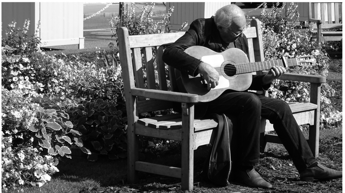
Fig 1. Upper image, example of distressing image. Lower image, example of a non-distressing image. Representative images are used in accordance with the copyright restrictions of the original images. Stimuli from the task are available on request.

https://doi.org/10.1371/journal.pone.0198273.g001