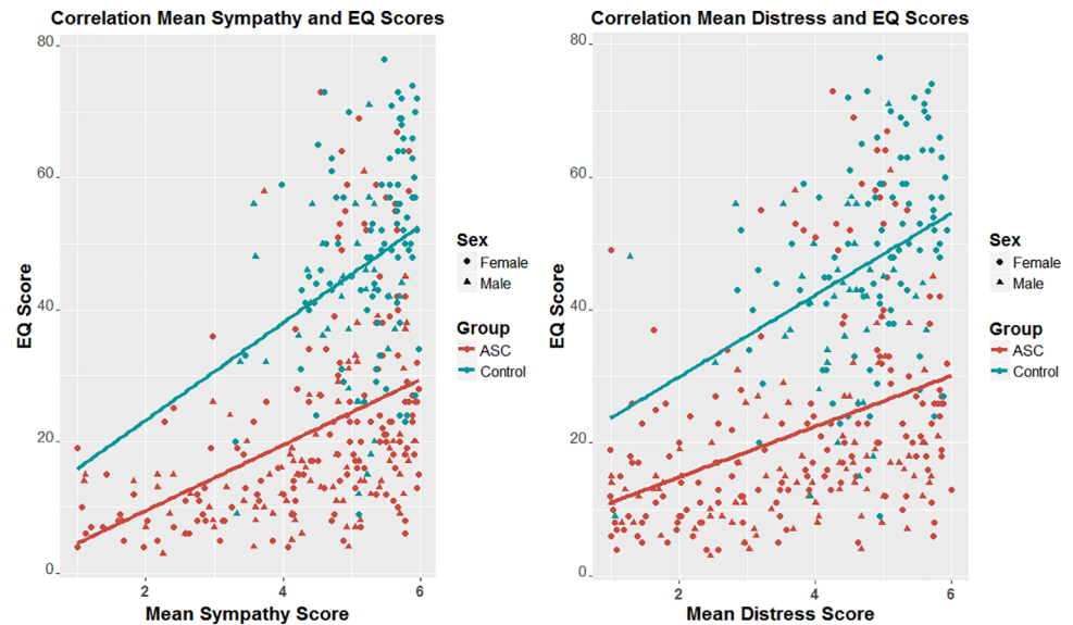
Fig 3. Left panel: Scatterplot showing the association between EQ and self-reported sympathy ratings; Right panel: Scatterplot of association between EQ and personal distress ratings. Scores from the autism group are shown in blue. Scores from the control group are shown in green. A line of best fit is shown.

https://doi.org/10.1371/journal.pone.0198273.g003