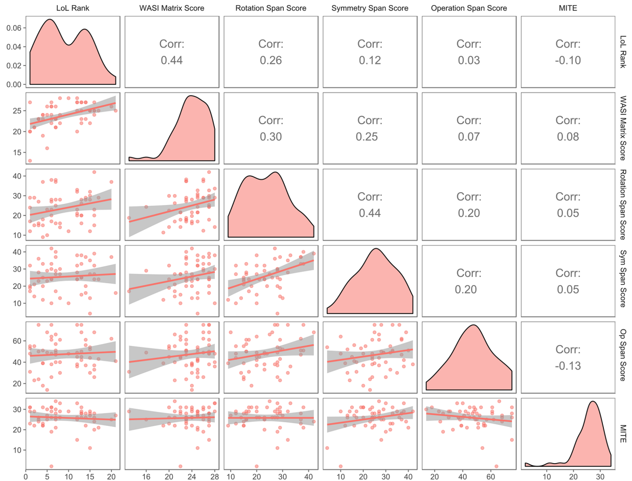
Fig 1. Cross correlations between variables of interest. The leading diagonal shows the distribution of the data. Numbers above the diagonal show the non-parametric cross correlation coefficient. Scattergrams of the data with best fit lines and error limits are shown below the leading diagonal. There is a moderately-sized and highly significant correlation between WASI-II Matrices and Rank ( r_s = .44, p = .001 ) and a weak but significant correlation between Rank and Rotation Span score with r_s = .26, p < .05 . The correlations between Rank and OSPAN and MITE task scores were not significantly correlated with with r_s = 0.3, p = .43 and r_s = -.01, p = .242 respectively.

https://doi.org/10.1371/journal.pone.0186621.g001