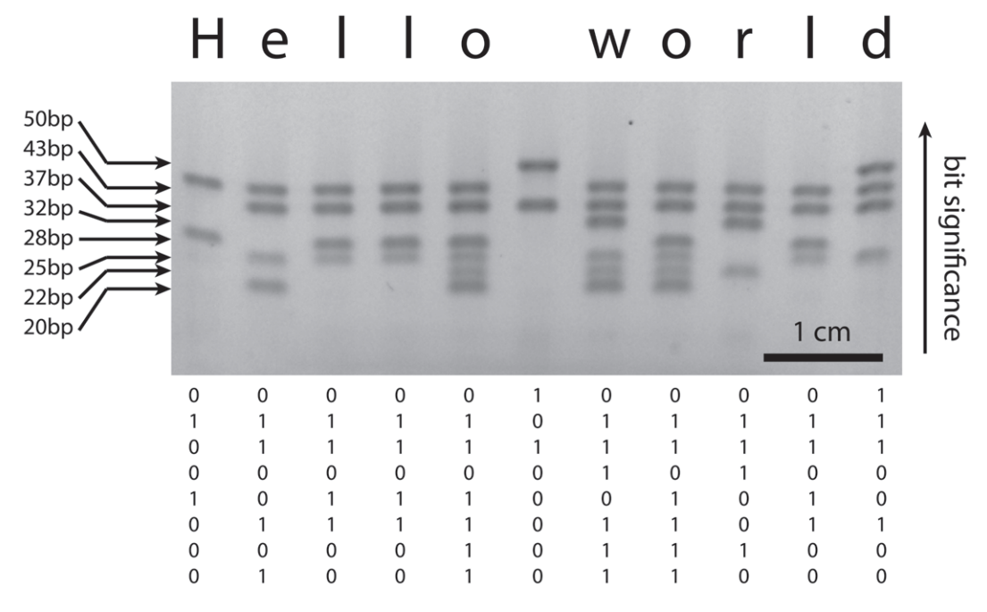
Figure 3. Decoding a binary message on a gel. Each lane of the gel contains a mixture of oligonucleotides which together form an 11 byte binary ASCII message which reads "Hello world". The bit strings are read from top to bottom with the most significant bit being the largest DNA segment. Presence of a band indicates a binary 1, while absence of a band indicates a binary 0. All lanes have the same amount of DNA present, but only the double stranded pieces dye. doi:10.1371/journal.pone.0044212.g003

expertise, expensive laboratory equipment, or time consuming processes, giving rise to a large asymmetry in effort compared to encrypting and decrypting the message with the proper keys.