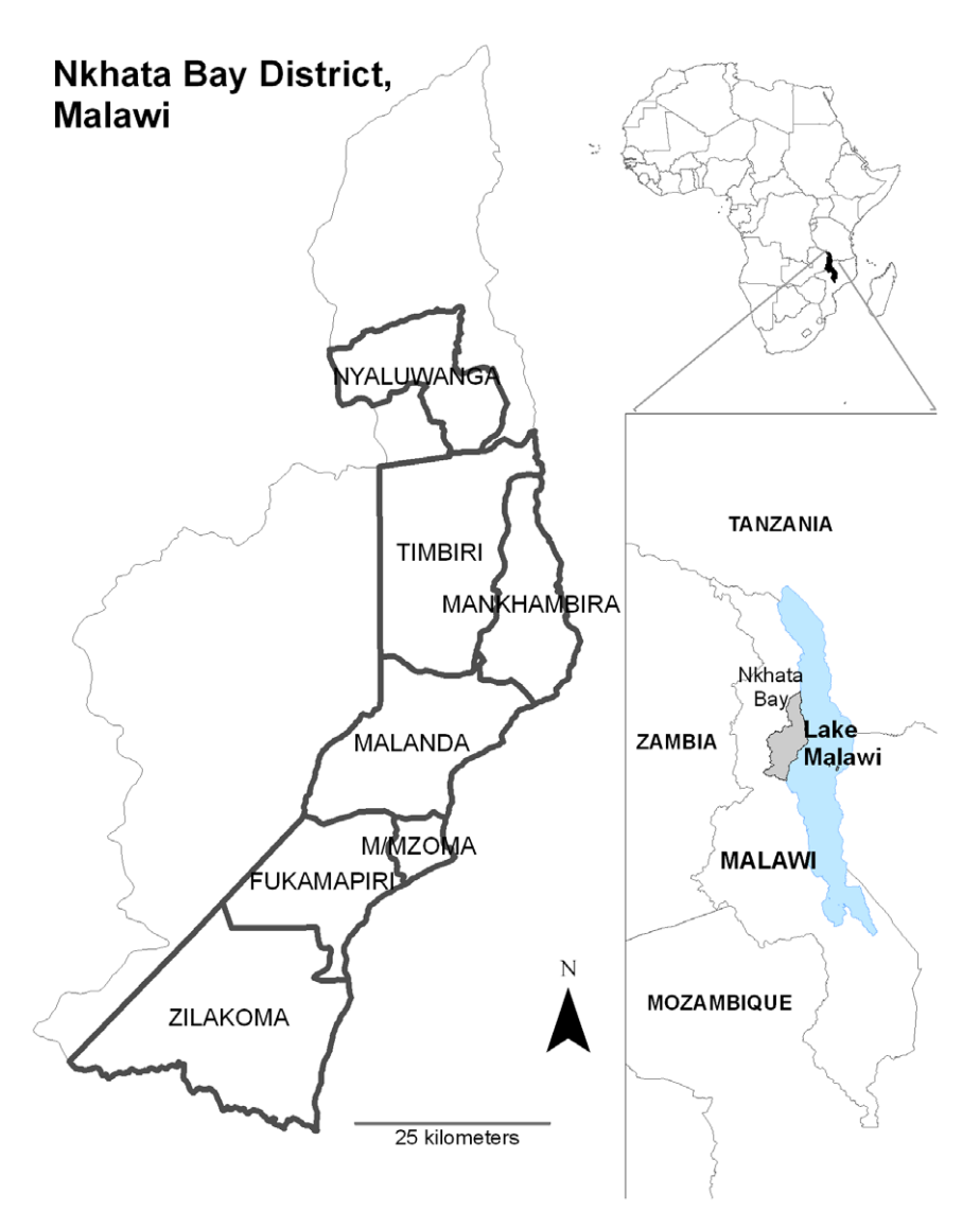
Figure 1. Household interviews were conducted to catalog the consequential lightning strikes in seven Traditional Authorities (TAs) of Nkhata Bay District, fringing the western shore of Lake Malawi. TA boundaries correspond to the period of 2008; Mankhambira TA shown here overlaps the urban TA of Mkumbira (not pictured), which comprises Nkhata Bay Town but was not surveyed. During sampling, Fukamalaza was combined with Malanda TA. doi:10.1371/journal.pone.0029281.g001

on the northwest shore protrudes into the lake and appears prone to disproportionate CLS from storms over the lake.