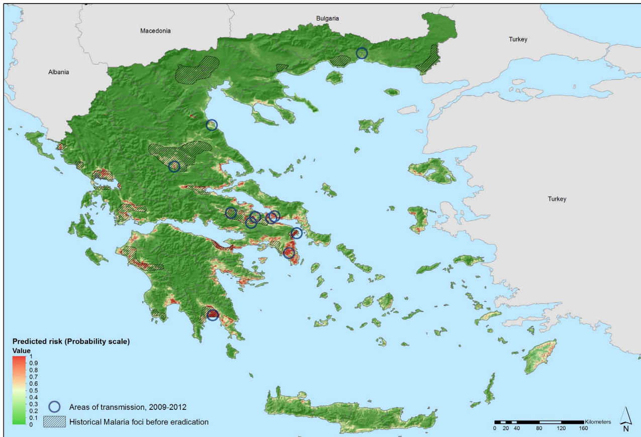
Figure 2. Areas predicted to be environmentally suitable for persistent malaria transmission in Greece, 2013. Note: Map adapted from [5]. Countrywide geo-referenced environmental and climatic data were used from the European Environment and Epidemiology (E3) Network data repository for spatial modeling (nonlinear discriminant analysis). Map illustrates areas predicted to be environmentally suitable for malaria transmission based on Plamosdium vivax transmission in Greece from 2009 to 2012. Values from 0 to 0.5 (dark to light green) indicate conditions not favorable for malaria transmission (based on locally acquired cases), as opposed to yellow to dark red areas that delineate conditions increasingly favorable for transmission (values from 0.5 to 1). Areas of historic malaria transmission in Greece refers to the period prior to the elimination in 1974, as a result of a national malaria elimination effort between 1946 and 1960. doi:10.1371/journal.pntd.0002323.g002

view, metadata information, and data downloading and uploading. The web portal will serve as the outreach tool for promoting collaboration and building a critical mass of individual, organisational, and consortium partners that will form the network of stakeholders. The E3 Network stakeholders will originate from the following groups: ECDC staff, E3 Network environmental data providers and partners (EU organizations and EU-funded research projects), Member States providing epidemiological data, the WHO (providing epidemiological data), research organizations, public health agencies, and others.