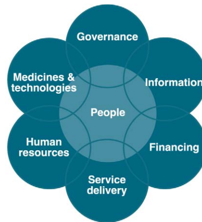
Figure 1. Health system building blocks [7]. doi:10.1371/journal.pmed.1000397.g001

control interventions, supported by strengthened health systems. The second phase—sustained control—aims to prevent the resurgence of malaria by maintaining universal intervention coverage until countries enter the elimination stage. In the final phase—elimination and eradication—it is estimated that more than 20 lower burden countries around the world will be poised to eliminate malaria.