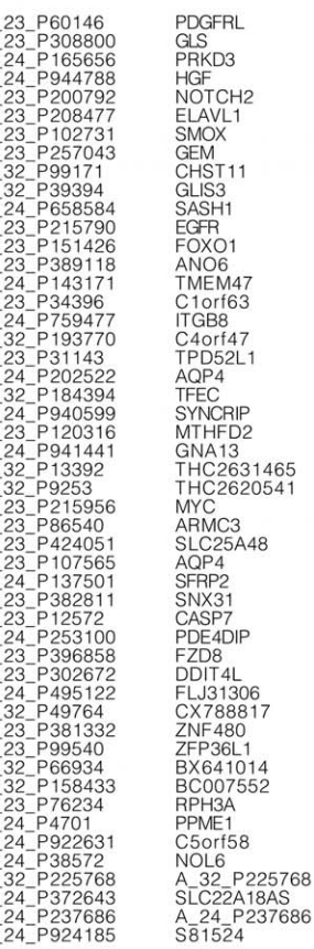
Figure 1. Top microarray probes. Probes with FDR-adjusted p-values smaller than 0.05 and with expression differences between PD and control prefrontal cortex BA9 samples greater than 1.5 fold changes. Twenty-one probes (42%) were in genes with FoxO1 transcription factor binding sites. The GENE-E software (http://www.broadinstitute.org/cancer/software/GENE-E/) was used to generate the heatmap. doi:10.1371/journal.pgen.1002794.g001