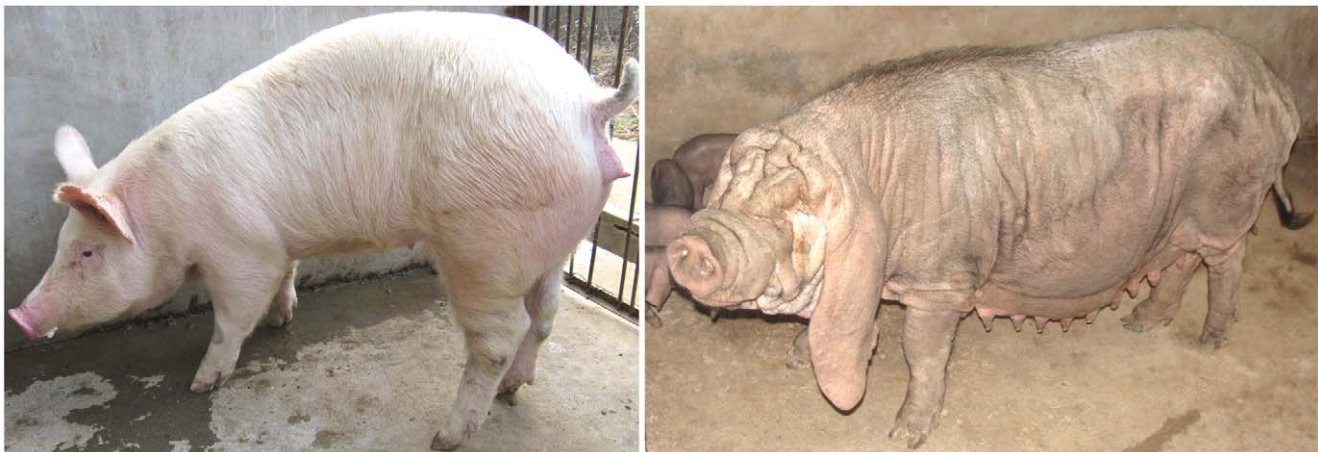
Figure 1. The Erhualian and White Duroc phenotypes. Erhualian pigs (right panel) are obese and short legged, have wrinkly face, extremely large and floppy ears. In comparison, White Duroc pigs (left panel) are renowned for muscularity and exhibit much smaller and half or fully pricked ears.