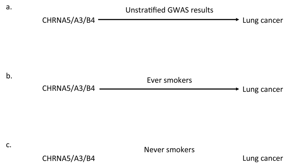
Fig 1. Illustration of the Mendelian randomization framework. In Mendelian randomization, if there is a causal effect of the exposure (e.g., smoking heaviness) that is being captured by the genotype on the outcome (e.g., lung cancer), then an association of genotype with the outcome should be detectable in a sufficiently large unstratified GWAS (panel A). This can be confirmed in a stratified analysis, where an association of genotype with the outcome should only be seen in the exposed group (i.e., smokers, panel B) and not the unexposed group (i.e., never-smokers, panel C). This is a special case of gene \times environment (G \times E) interaction, where both G and E are known, although it will not always be possible to stratify on the exposure, and stratification (which can be considered a form of statistical adjustment) can introduce other potential biases in certain circumstances (see \frac{1}{1000} Section 1.