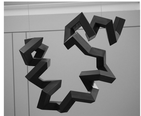
Figure 1. With the students' help, we transformed atomic coordinates (left, rendered with UCSF Chimera [28]) into remarkably accurate three-dimensional steel sculptures (right, approximately 1 m in height).