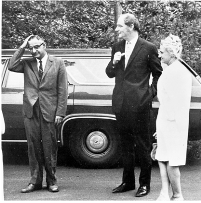
Image 2. H. G. Khorana. doi:10.1371/journal.pbio.1001273.g002

He thought constantly about effort and commitment, sometimes doubling down when projects seemed hopeless. But he also seemed to know when to quit, or better stated, when to move on to other work, sometimes related, but often totally new.